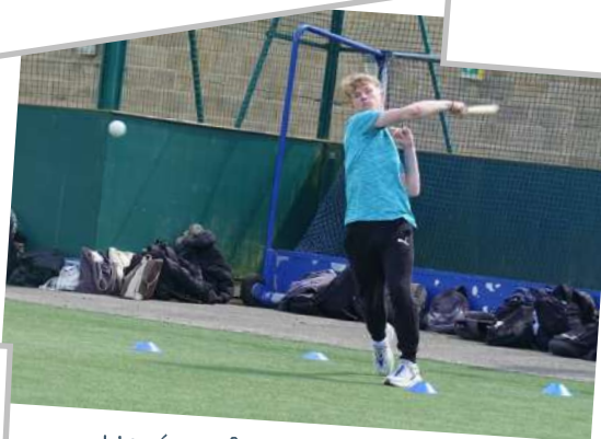
Having fun on the Astroturf