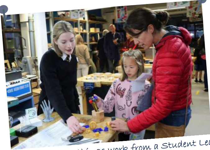
Finding out how things work from a Student Leader