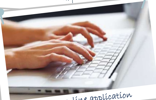
Easy on-line application