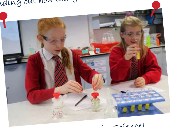
Mixing things up in Science!