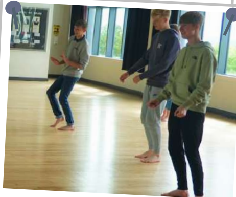
In step for Sixth Form