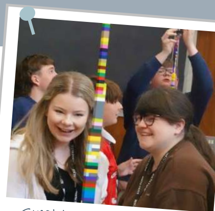
Great teamwork in the Lego challenge