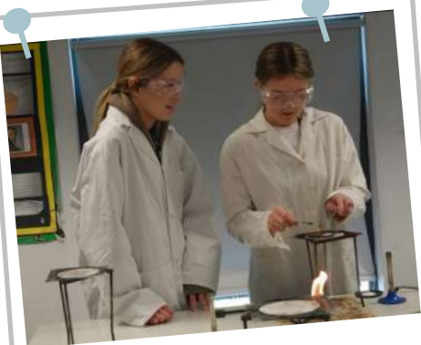
All fired up for Chemistry