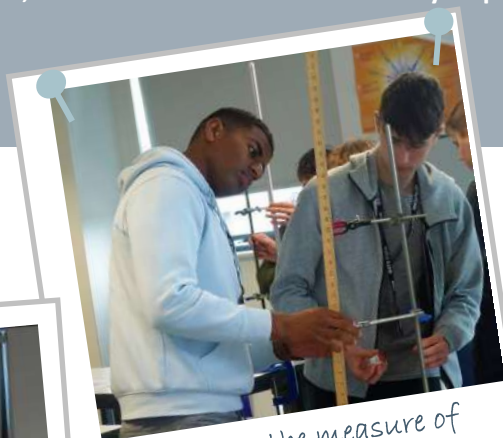
Getting the measure of things

In June, applicants are invited to two taster days. These are an opportunity to experience life in the Sixth Form. In August, after GCSE results, students who have met the entry requirements enrol and meet with staff to discuss options if necessary.