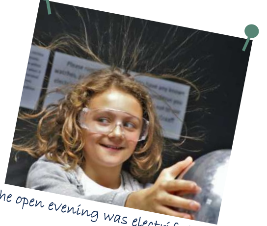
The open evening was electrifying!